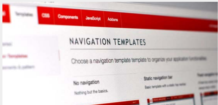
UI kit creation and documentation of a design pattern repository, Generali.