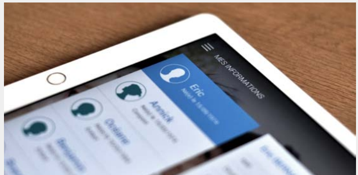
Tablet and mobile application, Assurance Maladie/NORSYS