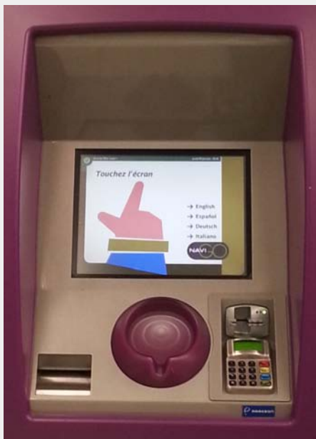
User Interface of Subway kiosk, RATP/ATTOMA

Freelance interaction designer I design efficient and simple user experiences.